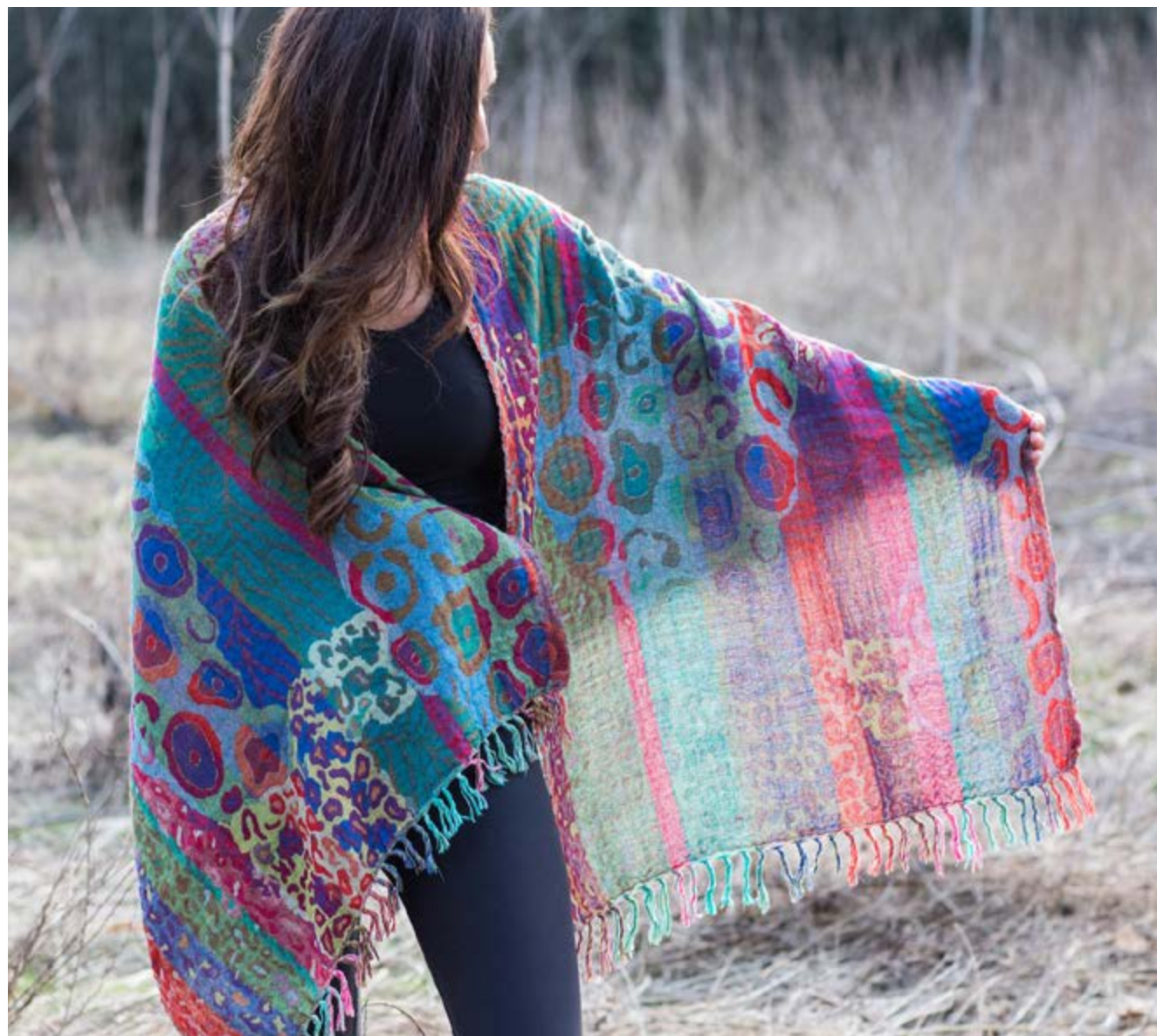
Klimt Merino Wool Shawl MWSAWWKL £25