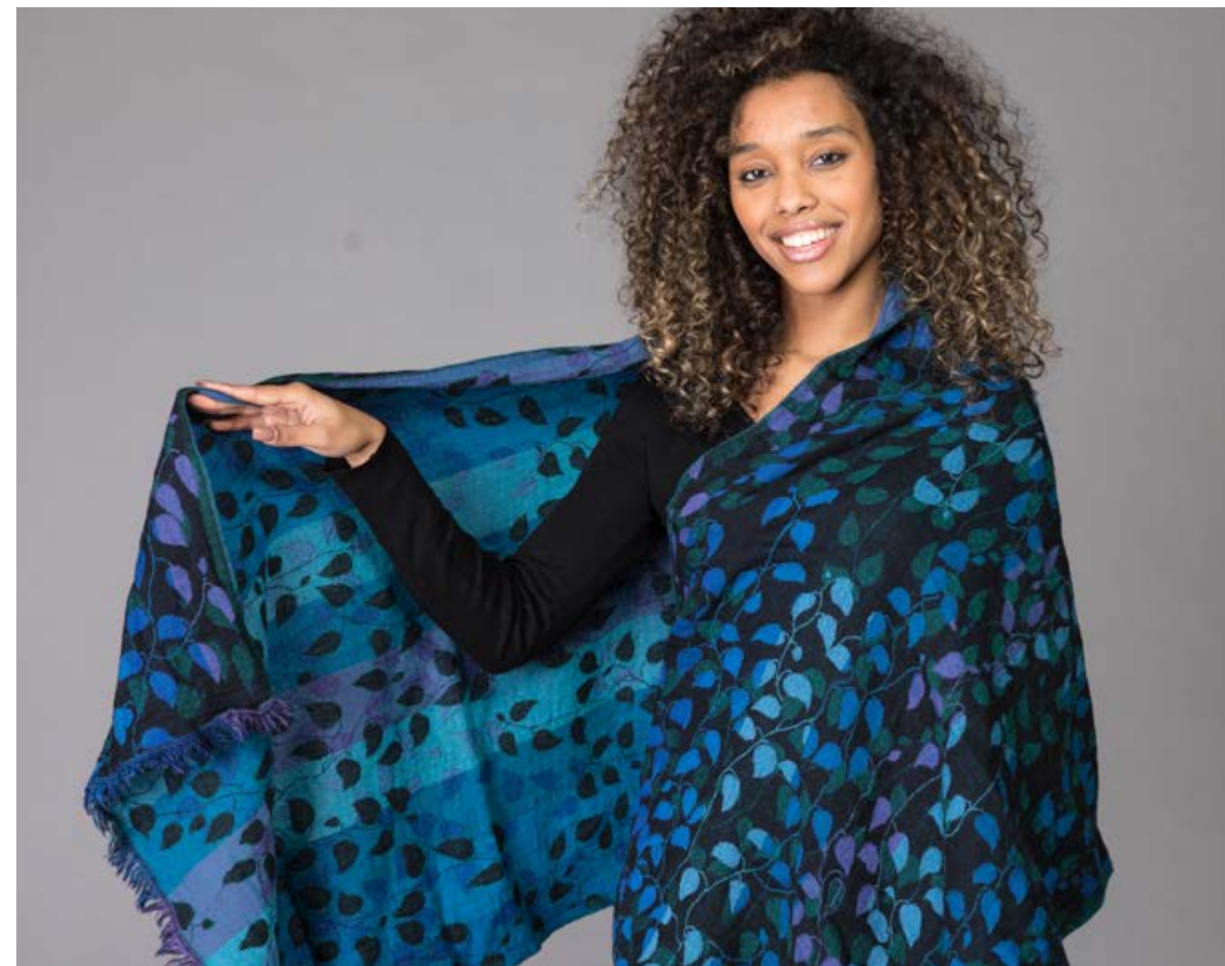
Midnight Leaves Merino Wool Shawl MWSAWWMIL £25