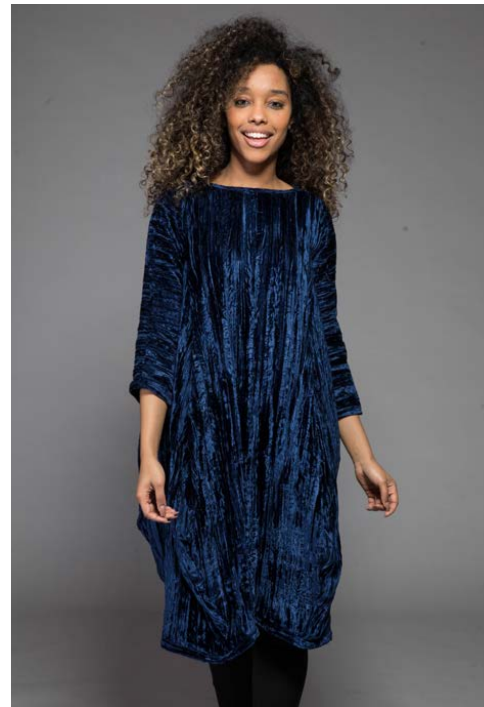
Farah Dress Crushed Velvet 4 Sizes S/M/L/XL FADVAW20BL £39