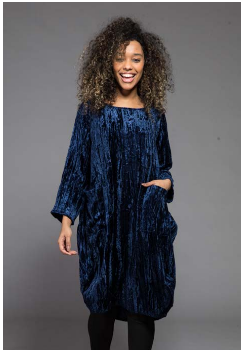
Roshan Dress Crushed Velvet 2 Sizes S/M & L/XL RDVEAW20BL £45