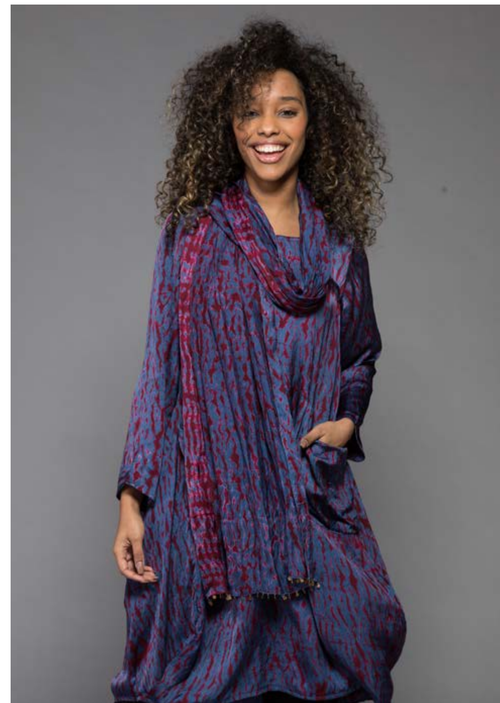
Bamboo Shibori Scarf HSBAAW204