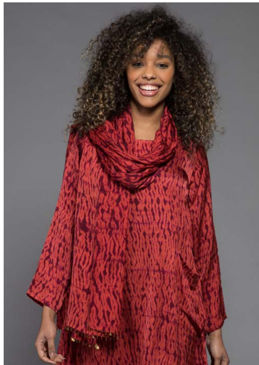
Bamboo Shibori Scarf HSBAAW205