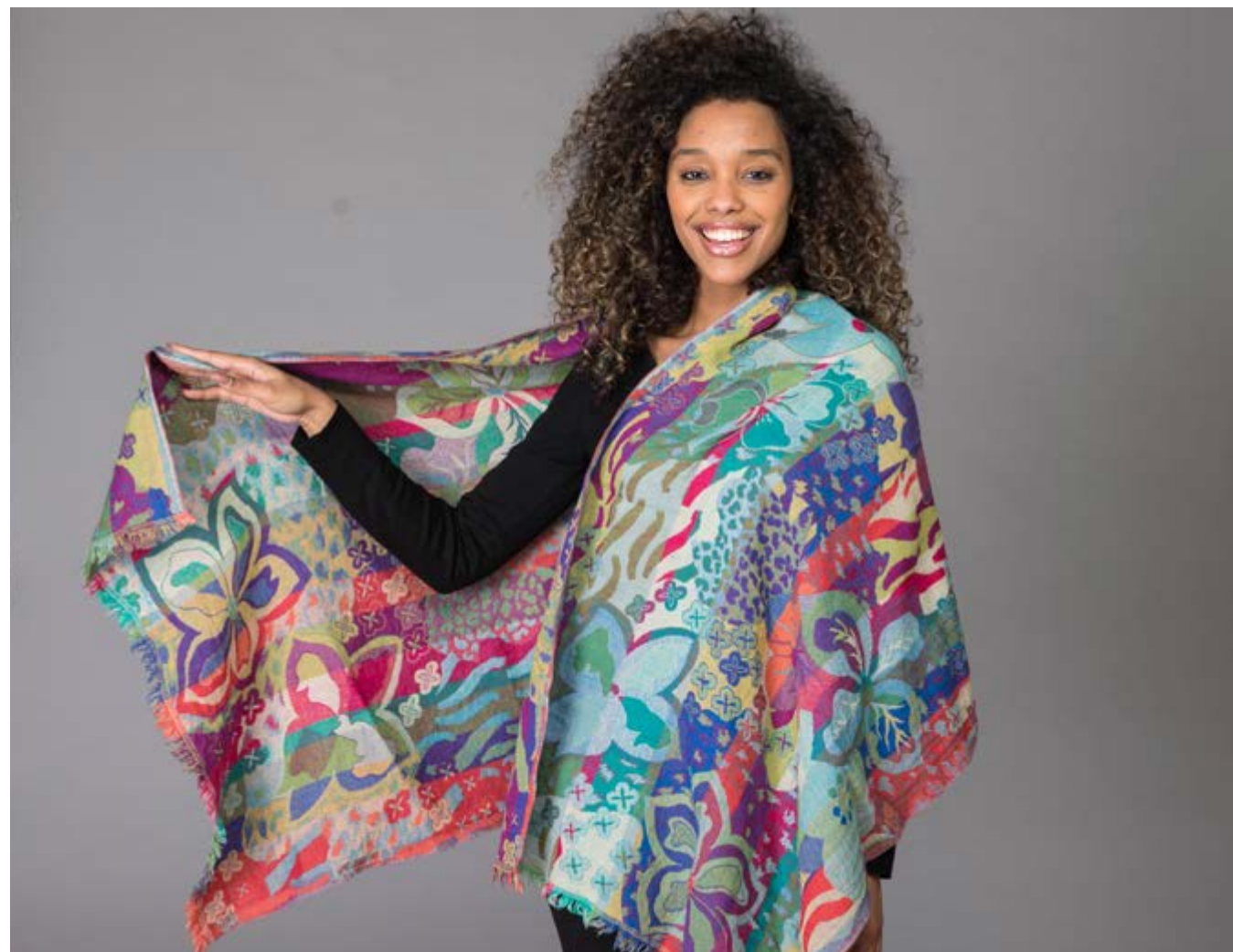
Jungle Flowers Merino Wool Shawl MWSAWWJF £25