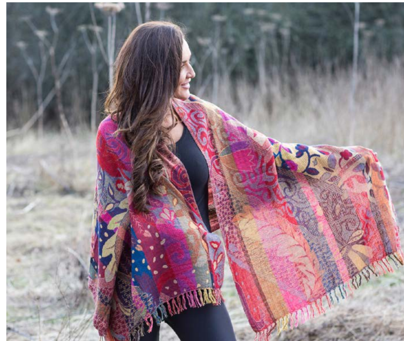
Tropical Forest Merino Wool Shawl MWSAWWTF £25